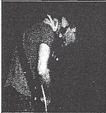
Bono and the Edge give tribute to Joey Ramone

large curtains draped the 'U' and Bono's shadow was visible through every