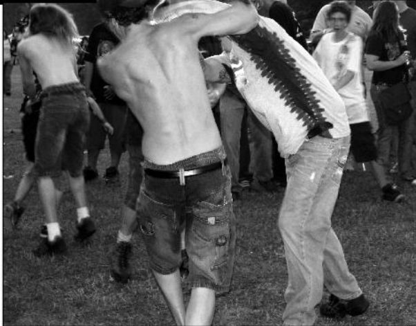
Moshers were abundant at the 3rd annual Indy Fest.