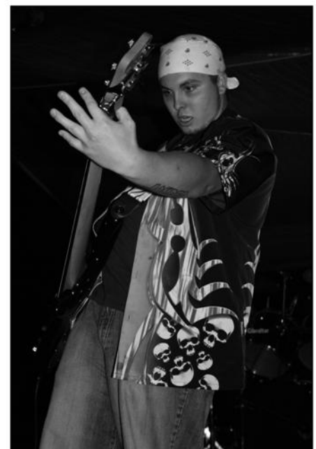
Bucyrus, Ohio's Source Of Conflict.

ON THE WEB myspace.com/ independencefest