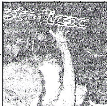
Endo joins Static-X for the encore.

females hurried to the stage's front at Wayne Static's (lead singer) request. Just before performing "Love Dump" off Wisconsin Death Trip .